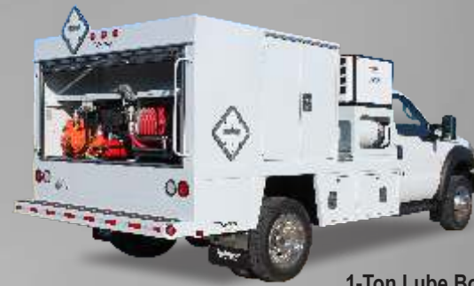
1-Ton Lube Body

Whatever your fluid applications require, Maintainer can help you create a custom package that exactly fits those needs