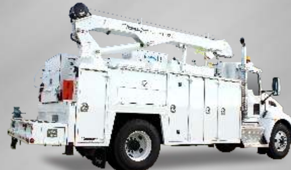
2-Ton Service Body with H10025 Crane