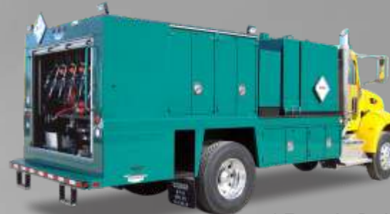
2-Ton Lube Body

Trucks Available With Alternative Fuel options... Such As Propane or Compressed Natural Gas!