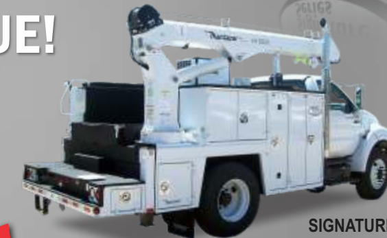
SIGNATURE SERIES 2