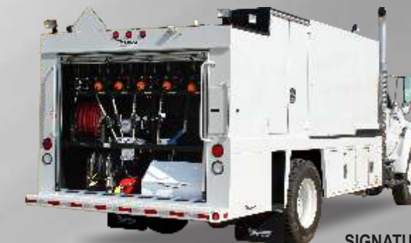
SIGNATURE SERIES 4