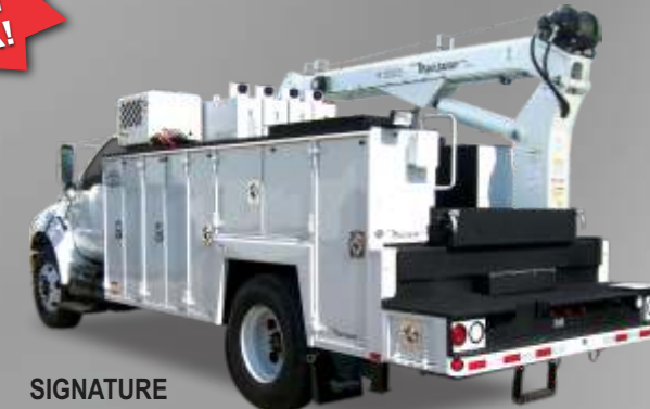
SIGNATURE SERIES 5