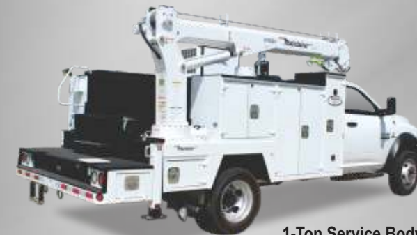
1-Ton Service Body with H7024 Crane

Maintainer service bodies are built to meet the most rugged on/off road conditions