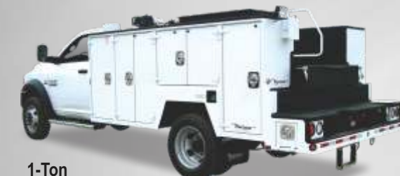
1-Ton Service Body