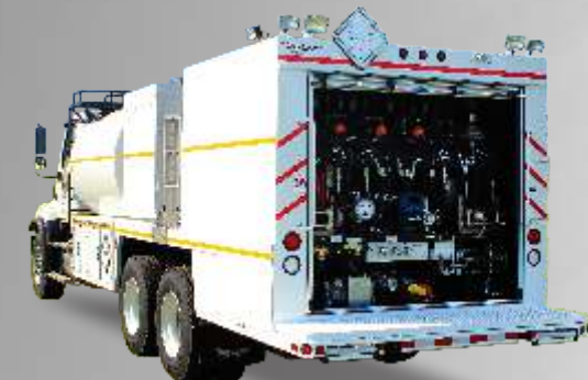
2-Ton Lube with Tandem Axle