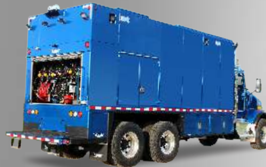
2-Ton Lube Van with Tandem Axle