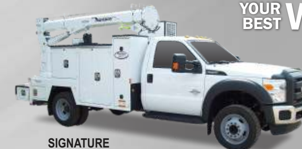
SIGNATURE SERIES 1