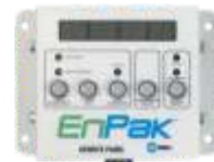
A60HGE Remote Panel