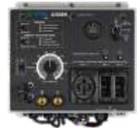
A30GBW Remote Panel

EnPak® REMOTE PANELS Monitors and displays engine and air compressor status.