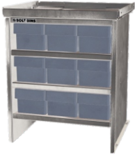
#026067 9 BINS

3 wide x 3 tall Bottom space - 4.5" 18.5"w x 23.5"h x 18.5"d weight = 50 lbs.