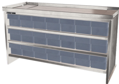
#026065 21 BINS

7 wide x 3 tall Bottom space - 3.5" 41.2"w x 22.5"h x 18.5"d weight = 97 lbs.