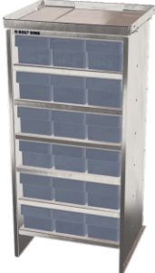
#026068 18 BINS

3 wide x 6 tall Bottom space - 4.5" 18.5"w x 40.8"h x 18.5"d weight = 85 lbs.