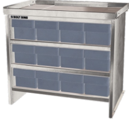
#026062 12 BINS

4 wide x 3 tall Bottom space - 4.5" 24.2"w x 23.5"h x 18.5"d weight = 62 lbs.