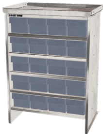
#026063 20 BINS

4 wide x 5 tall Bottom space - 4.5" 24.2"w x 35"h x 18.5"d weight = 92 lbs.