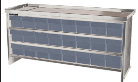
#026066 24 BINS

8 wide x 3 tall Bottom space - 3.5" 46.8"w x 22.5"h x 18.5"d weight = 108 lbs.