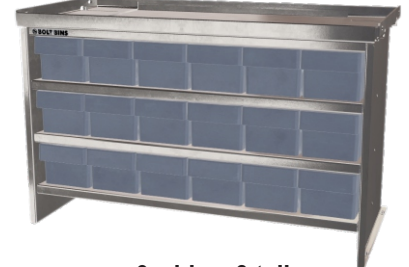
#025928 18 BINS

6 wide x 3 tall Bottom space - 3.5" 35.5"w x 22.5"h x 18.5"d weight = 85 lbs.