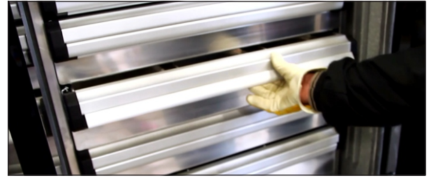
ONE CLICK unlocks the closed drawer...